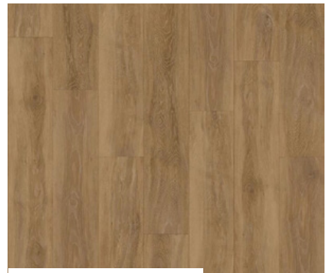
Vermilion SPECIAL • ORDER