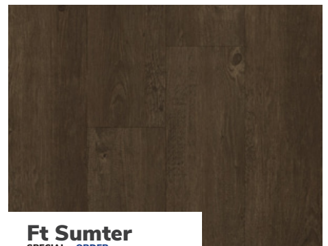
Ft Sumter SPECIAL • ORDER