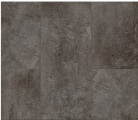
Teton SPECIAL • ORDER