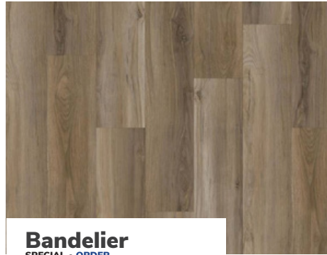
Bandelier SPECIAL • ORDER