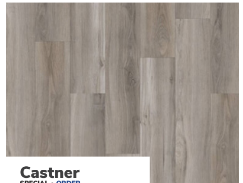
Castner SPECIAL • ORDER