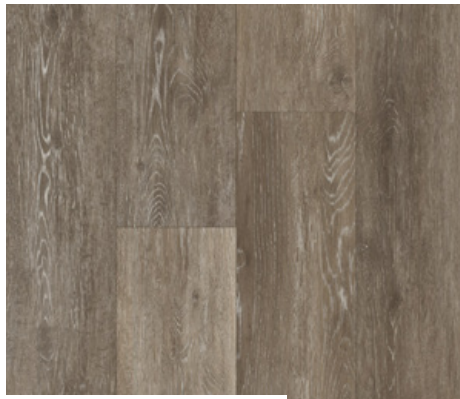
San Jacinto SPECIAL • ORDER