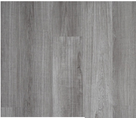
Marianas SPECIAL • ORDER