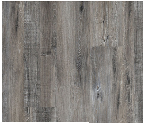
Sonoran SPECIAL • ORDER