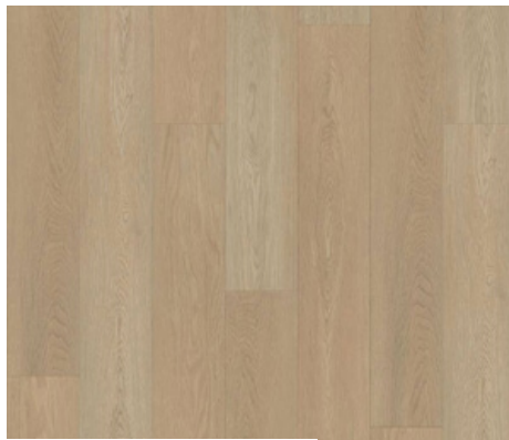
Timpanogos SPECIAL • ORDER