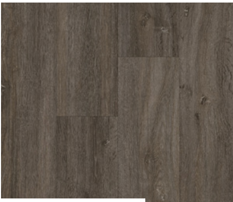
Misty Fjords SPECIAL • ORDER