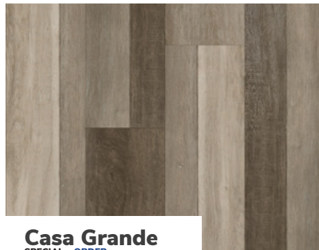
Casa Grande SPECIAL • ORDER