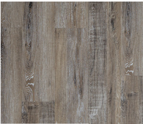
Yosemite SPECIAL • ORDER