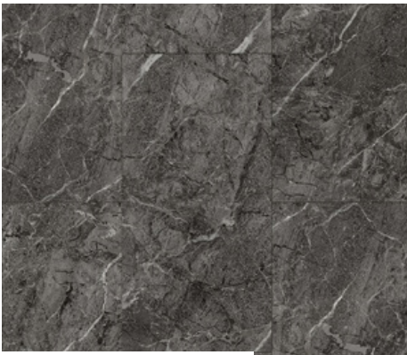
Hagerman SPECIAL • ORDER