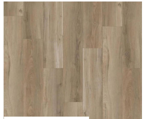
Rushmore SPECIAL • ORDER