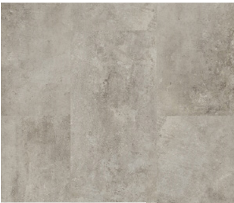
Niagara SPECIAL • ORDER