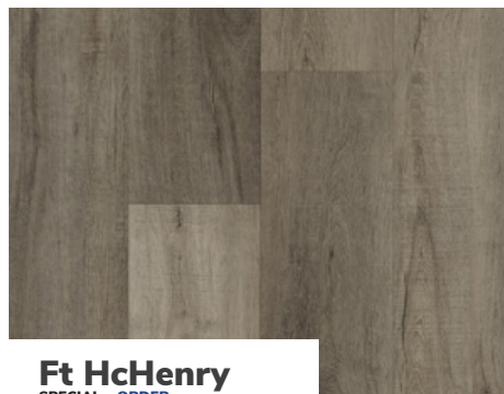
Ft HcHenry SPECIAL • ORDER