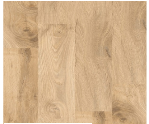
San Joaquin SPECIAL • ORDER