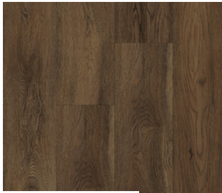
Homestead SPECIAL • ORDER