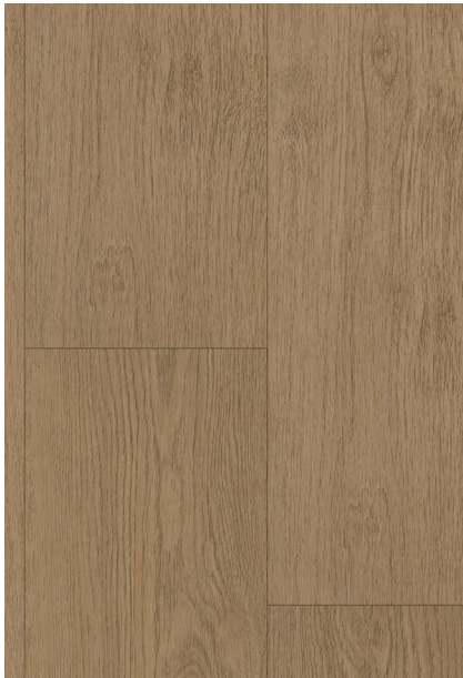
Teton QUICK • SHIP