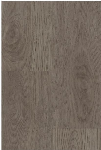
San Juan QUICK • SHIP