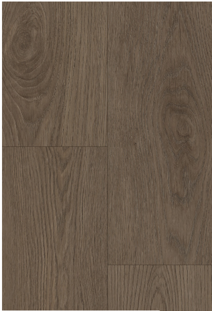
Antero QUICK • SHIP

Available to ship within 10 business days for orders under 2,500 sqft.