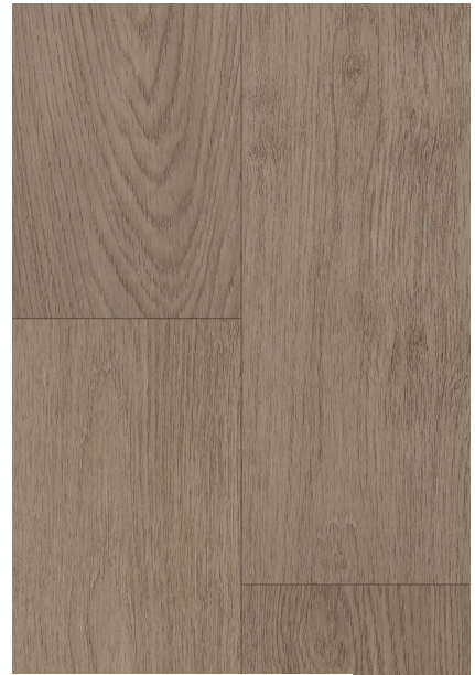
Sierra QUICK • SHIP