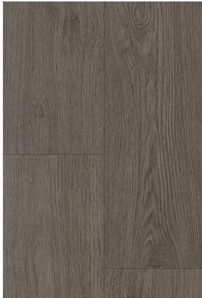
Wrangell QUICK • SHIP