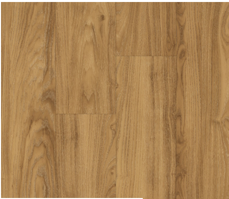
Mesa Verde QUICK • SHIP