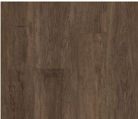
Sequoia QUICK • SHIP