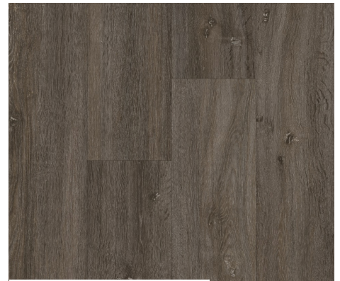
Misty Fjords SPECIAL • ORDER