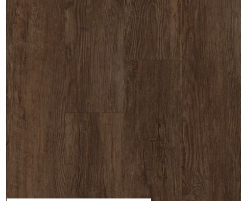
Yucca House QUICK • SHIP