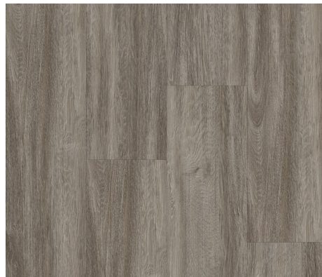
Stonewall QUICK • SHIP