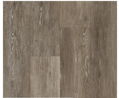
San Jacinto SPECIAL • ORDER