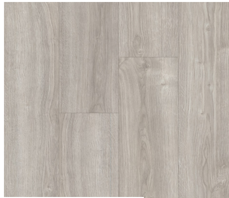
Mesilla Plaza SPECIAL • ORDER