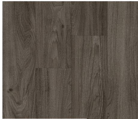
Pullman QUICK • SHIP