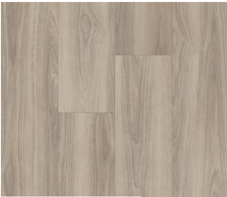
Mt Vernon QUICK • SHIP